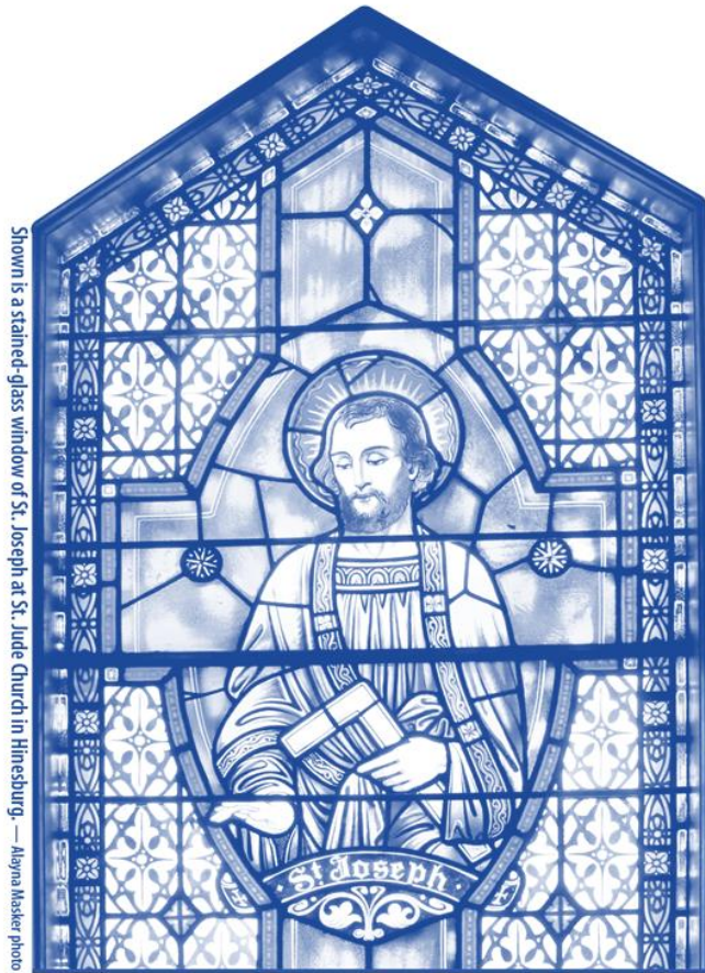
Shown is a stained-glass window of St. Joseph at St. Jude Church in Hinesburg.